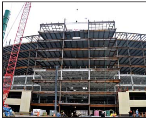
Raising the beam