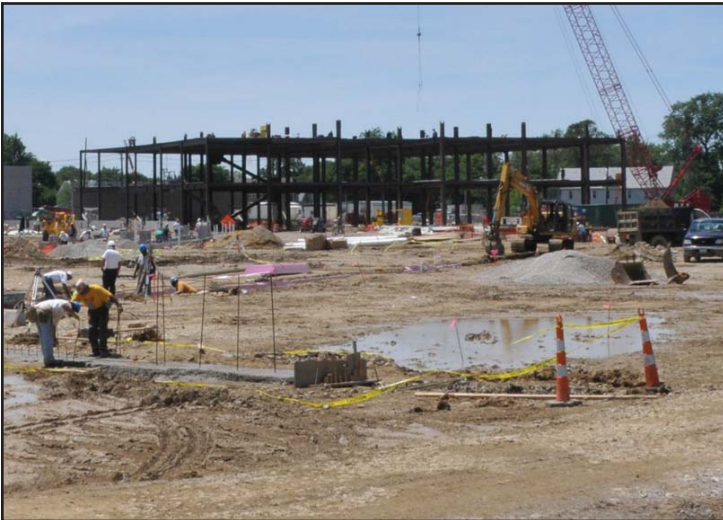
Main Level East Area