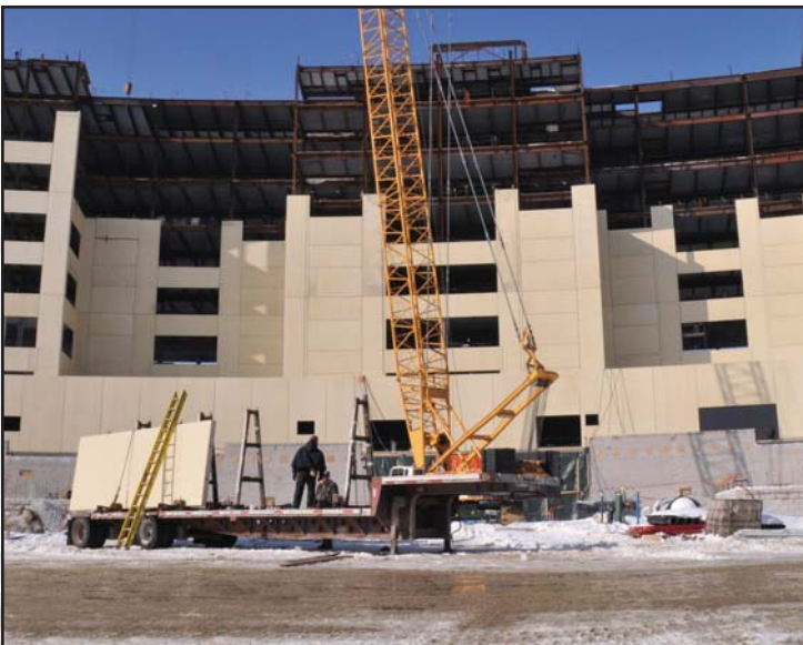
Main Tower – Precast Installation

If you lose your copy, you can always find it online at CuyahogaCounty.us